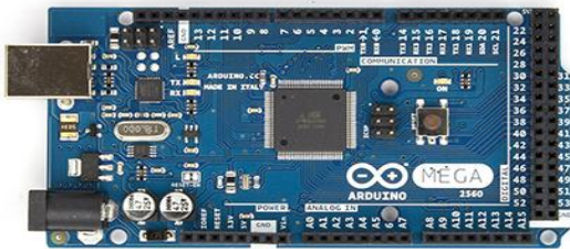
Arduino Mega 2560 R3 Front